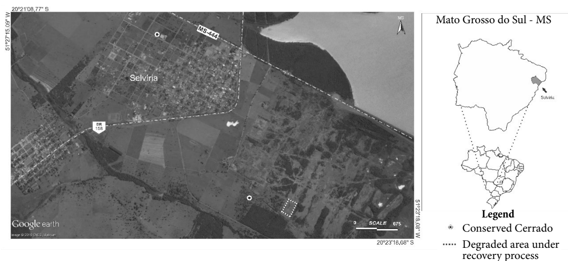
Figure 1. Location of the experimental area (degraded area under recovery process) and conserved Cerrado area where leaf samples were collected.

On February 2012, the seedlings of 10 species found in the remaining Brazilian Savannah near the experimental area were introduced to the experimental area. The plants were placed in 0.40 m depth pits of 4.0 × 5.0 m spacing. A total of 1,080 seedlings were introduced. Each block received three individuals of each species. D. alata was one of these species, with seedlings of 0.20 and 0.30 m high being used.